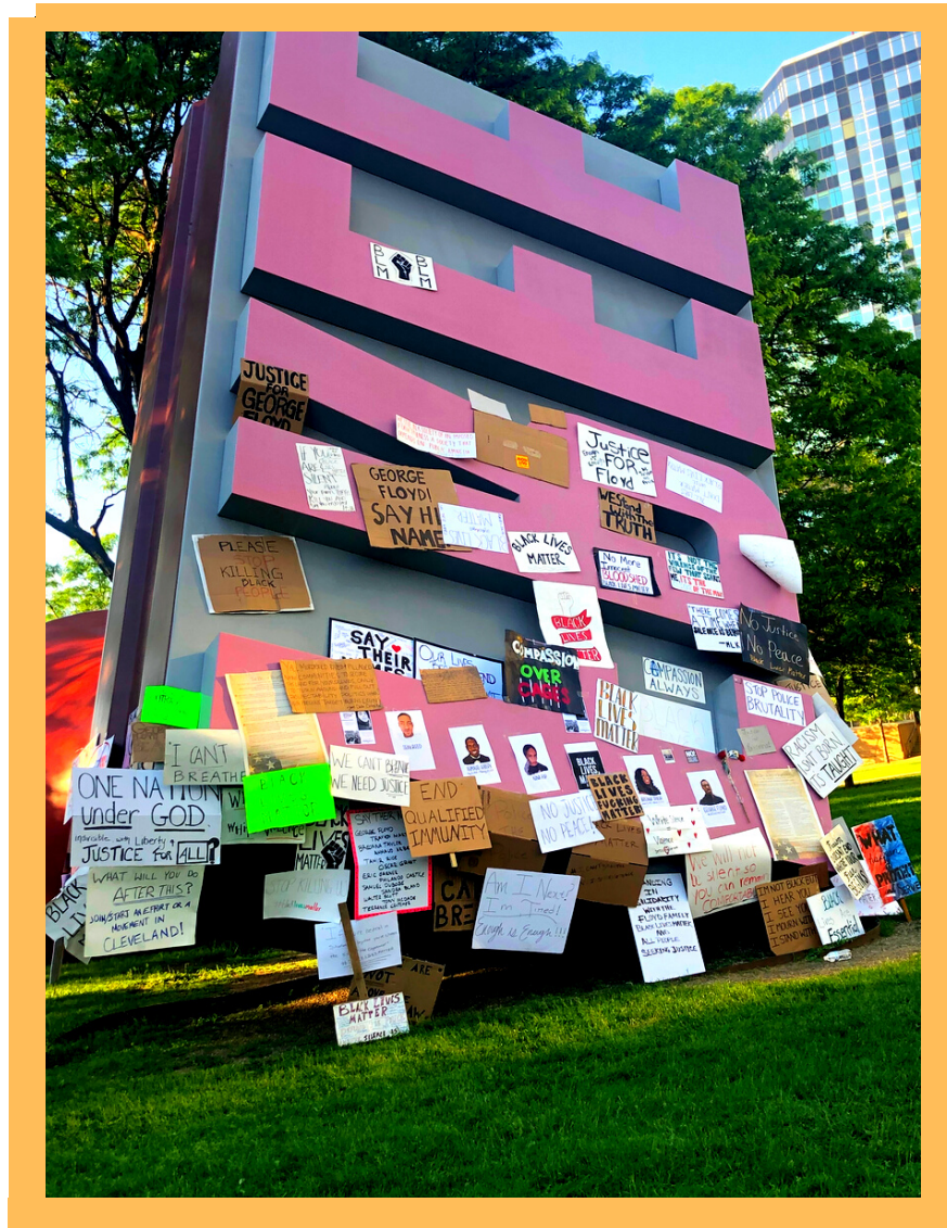
Downtown Cleveland's "Free Stamp" sculpture was partially covered by signs following the May 30, 2020, George Floyd protest.

Thanks to our dedicated leadership team, growing membership, institutional and community partnerships, and plans for a new podcast, newsletter, and other committee-driven activities, the best is yet to come!